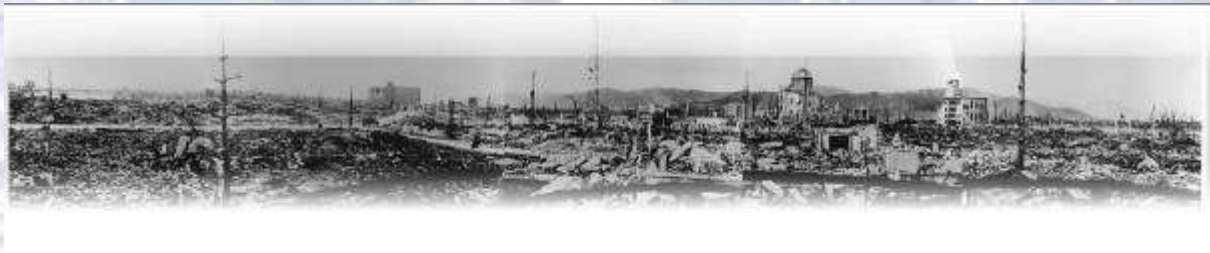
Fig.1 Panoramic view after bombing (Oct.1945-Mar.1946)

This article declares the meaning and import of this law. All peoples throughout the world seek genuine and lasting peace as an ideal. The intent of this law was to construct Hiroshima as a city that symbolizes lasting peace and Japan's renunciation of war.