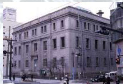
Fig.6 Former Hiroshima office of Bank of Japan

In May 2000, Bank of Japan made a decision to donate land and building of former Hiroshima office to the City of Hiroshima without compensation on condition that this building is designated as a national important cultural property.