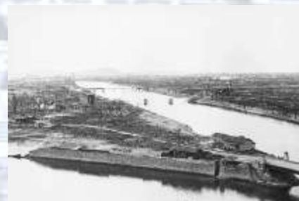
Fig.2 Nakajima District after bombing

The Nakajima District is located in the center of the City and lies between the two rivers, the Motoyasugawa and the Honkawa. It was formerly one of the city's main business districts. In 1946, much of this area was set aside as Nakajima Park under the Hiroshima