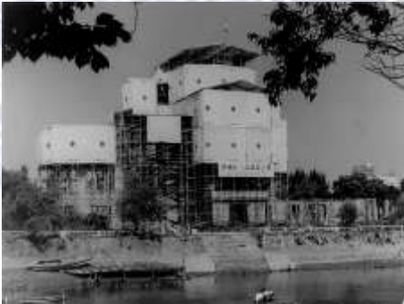
Fig. 10 A-Bomb Dome under first preservation work (1967)

Preservation work of the A-Bomb Dome was carried out three times (1967, 1990, 2002) funded largely by the donations of private citizens. And, As well, Hiroshima Municipal Baseball Stadium was built in 1958 as center of sports with the donations of local financial circles.