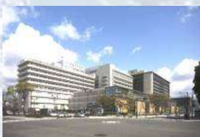
Fig.7 Hiroshima Citizen's Hospital

These are examples of facilities constructed on the land donated by the national government.