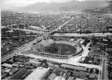
Fig. 11 Hiroshima Municipal Baseball Stadium after completion (1958)

(Application of the Acts) Article 7 Unless otherwise stipulated by this law, the Special Town Planning Law and the Town Planning Law shall apply to the Peace Memorial City Construction Plan and the Peace Memorial City Construction Endeavors.