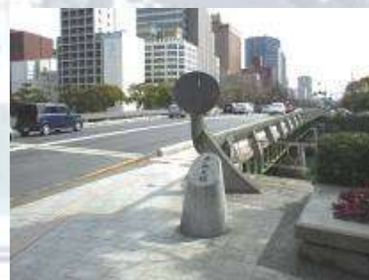
Fig.5 Present Heiwa-ohashi Bridge

In May 2000, Bank of Japan made a decision to donate land and building of former Hiroshima office to the City of Hiroshima without compensation on condition that this building is designated as a national important cultural property.