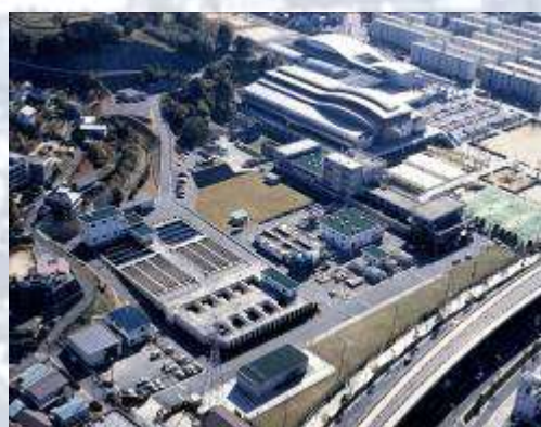
Fig.9 Hiroshima Big Wave and Ushita Filtration Plant