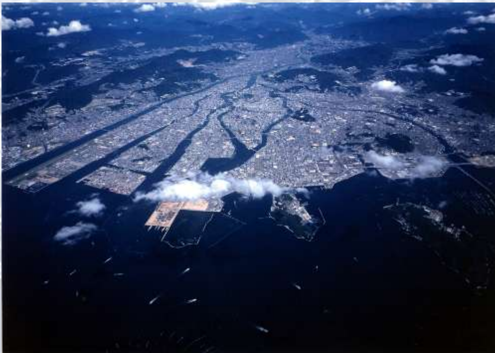
The City of Hiroshima

Hiroshima was reconstructed in accordance with the law and the plan, which even today serve as the basis for town planning.