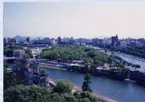
Fig.3 Present Nakajima District

In accordance with the Town Planning Law, the Park and the Atomic Bomb Dome were designated as a memorial to world peace.